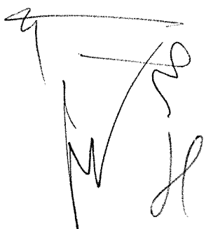
Diagramma Y (X)